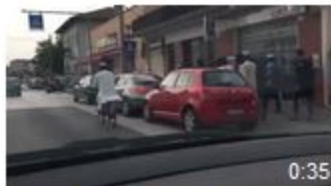
Italie, terre d'accueil Condor 22-02-2018 - Vues: 10756