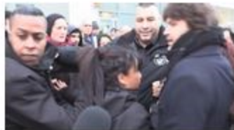
Cantat, gauchiste et assassin Condor 14-03-2018 - Vues: 6885