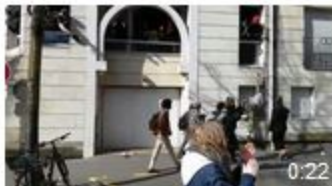
Babouins heureux Condor 10-03-2018 - Vues: 7813