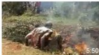
Massacre de chrétiens Condor 03-03-2018 - Vues: 14149