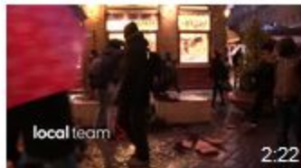
Sénégalais "migrants" Condor 07-03-2018 - Vues: 11055