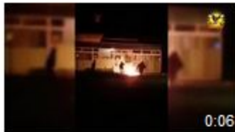
Brûle la mosquée... Condor 11-03-2018 - Vues: 9248