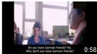
Intégration! Condor 22-02-2018 - Vues: 14301