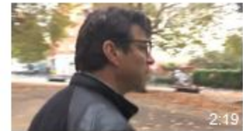
Le petit commerce parisien Condor 07-11-2017 - Vues: 10349