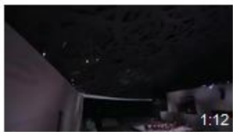
louvre Condor 09-11-2017 - Vues: 11184