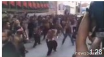
Musulmans à Athènes Condor 07-11-2017 - Vues: 12133