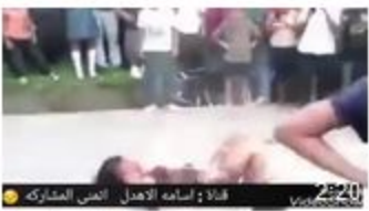
Droits de la Femme en pays musulman Condor 08-11-2017 - Vues: 27902